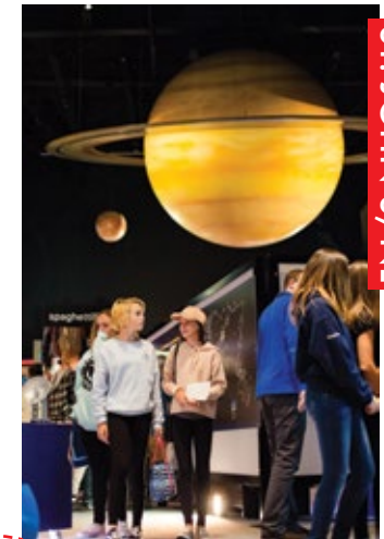
ST. JOHN'S, NL

Find more stories of innovation, tour highlights, and more at www.innovation150.ca .